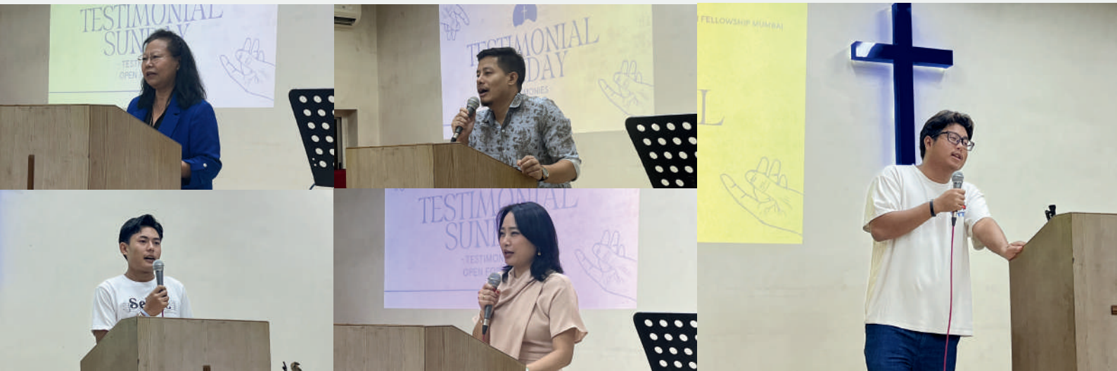
On 28th December 2025, we observed Testimonial Sunday , where church members came forward to testify about what God has done in their lives. Many shared their testimonies of blessings, healing, forgiveness, answered prayers and God's faithfulness.