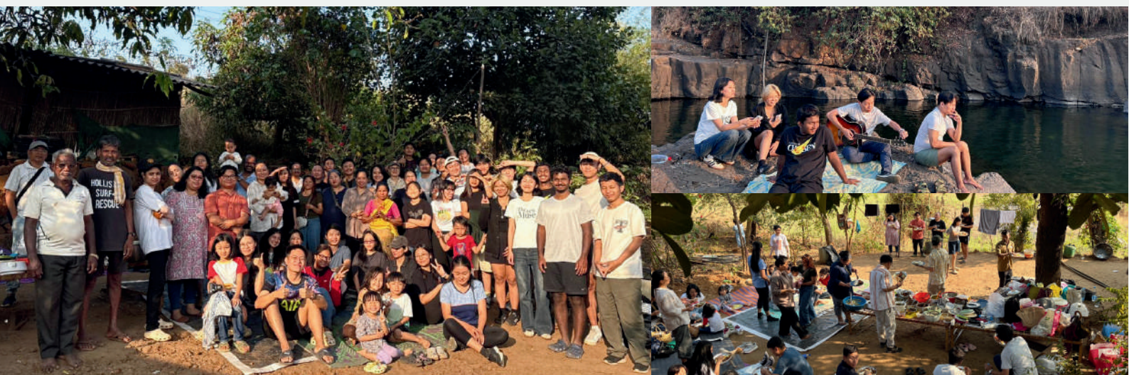
We had a Church Outing on the 10th of January at Kondichi Wadi. It was a memorable day of sharing potluck food, playing games, catching fish, swimming in the river and enjoying friendship and fellowship.