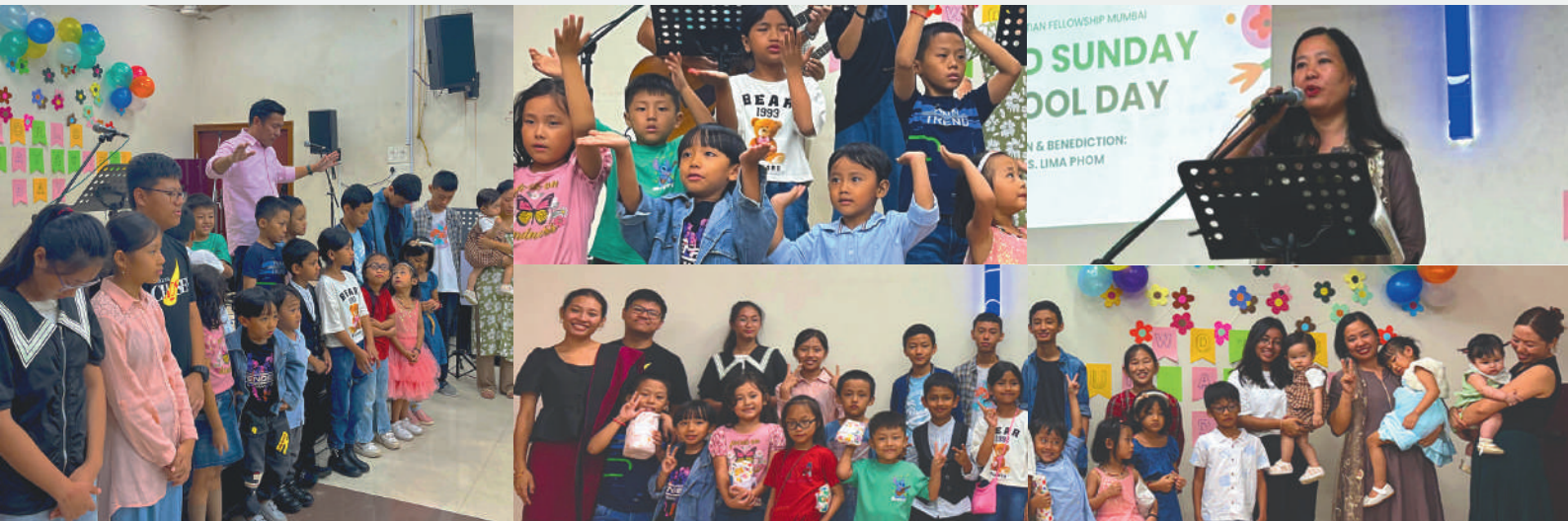
NCF Mumbai joined the rest of the world in celebrating World Sunday School Day on 2nd November 2025. It was a day filled with great joy, celebrating the precious gift of children in our lives. They showcased their best talents on that special day. A special prayer was offered by our dear Pastor for the little ones and the teachers.