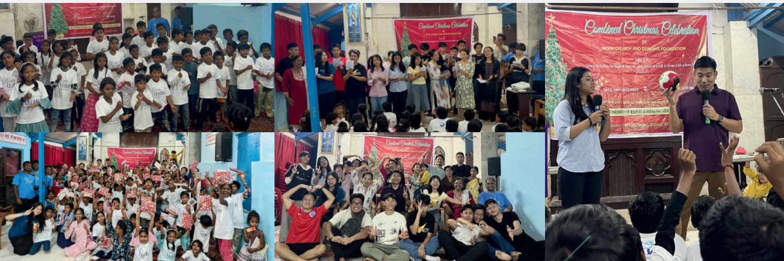
NCF Mumbai carries out a Christmas Outreach on the eve of Christmas every year. On 13th December, we collaborated with Dunamis Ministry and conducted a successful outreach, sharing the love of Jesus among slum children and mothers in Panvel, Navi Mumbai.