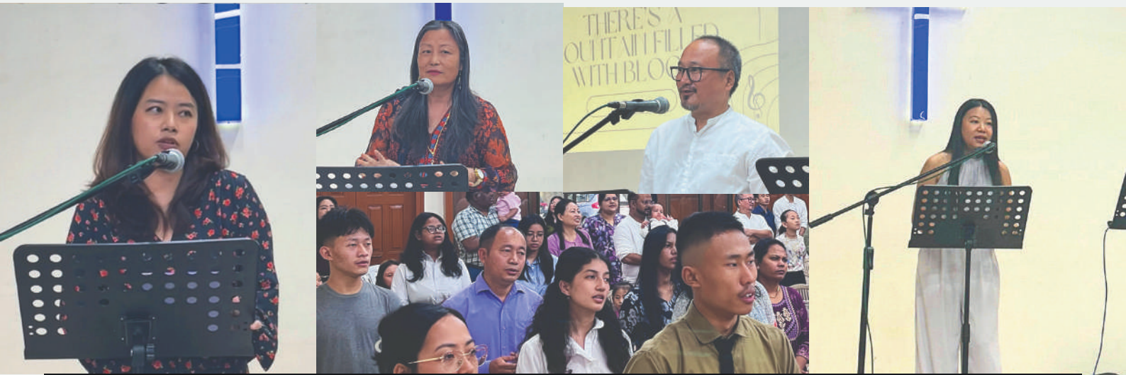
Every year, NCF Mumbai observes Hymnal Sunday to reflect on the depth of hymns and the richness of what God has done for us. On 18th October 2025, the assigned members led us into a meaningful time of study and singing of beautiful hymns.