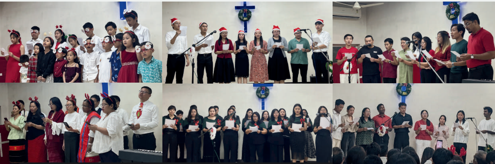
We celebrated the much-awaited Advent Christmas on 7th December 2025 . A highlight of the day was the Carol Singing Competition among the different Groups of NCF Mumbai. Navi Mumbai Connect won the first prize in the singing competition.